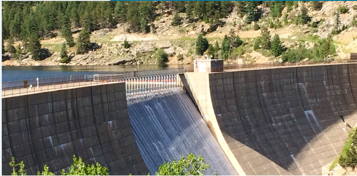
The Gross Reservoir Expansion Project will add 77,000 acre feet to storage, nearly tripling reservoir capacity.

The Gross Reservoir Expansion Project Team anticipates a Record of Decision from the U.S. Army Corps of Engineers by the end of 2015. With that in place, preconstruction activities will begin immediately.